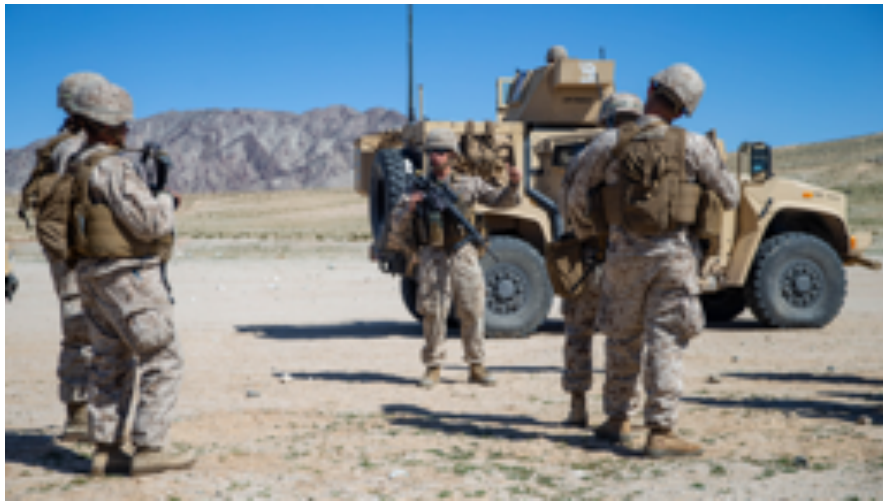
MARINE CORPS AIR GROUND COMBAT CENTER TWENTYNINE PALMS, CA, 2nd Marine Logistics Group 02.27.2024

U.S. Marines with 3d Littoral Combat Team, 3d Marine Littoral Regiment, 3d Marine Division, ride in Utility Task Vehicles for company attacks during exercise Bougainville III at Pohakuloa Training Area, Feb. 10, 2024. Bougainville III is a 3d LCT live-fire exercise focused on decentralized operations to prepare the battalion to command and control forces from dispersed locations.