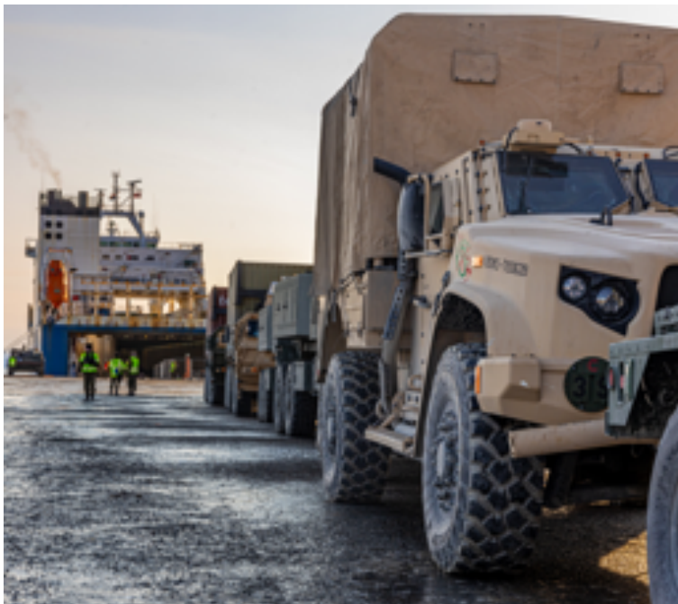
TALVIK, NORWAY II Marine Expeditionary Force 03.02.2024

U.S. Marine Corps Joint Light Tactical Vehicles with Combat Logistics Battalion 6, Combat Logistics Regiment 2, 2nd Marine Logistics Group, staged at a pier offload in preparation for Exercise Nordic Response 24, Talvik, Norway, March 2, 2024. Exercise Nordic Response 24 is a biennial NATO exercise designed to enhance military capabilities and allied cooperation. This exercise will test military activities ranging from the reception of allied and partner reinforcements and command and control interoperability to combined joint operations, maritime prepositioning force logistics, integration under challenging Arctic conditions, in high-intensity warfighting including rugged terrain and extreme cold weather with NATO militaries, and reacting against an adversary force during a dynamic training environment. (U.S. Marine Corps photo by Lance Cpl. Christian Salazar)