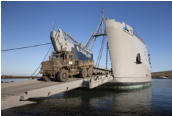
HI, UNITED STATES 02.14.2024

U.S. Marines with 3d Littoral Logistics Battalion, 3d Marine Littoral Regiment, 3d Marine Division, step away after hooking a Joint Light Tactical Vehicle onto a Army CH-47 Chinook during the 3d Littoral Logistics Battalion's Helicopter Support Team training at Marine Corps Training Area Bellows, Hawaii, Feb. 2, 2024. The 3d LLB undergoes transportation training under the pressure of a tactical scenario in order to prepare realistically for future operations.