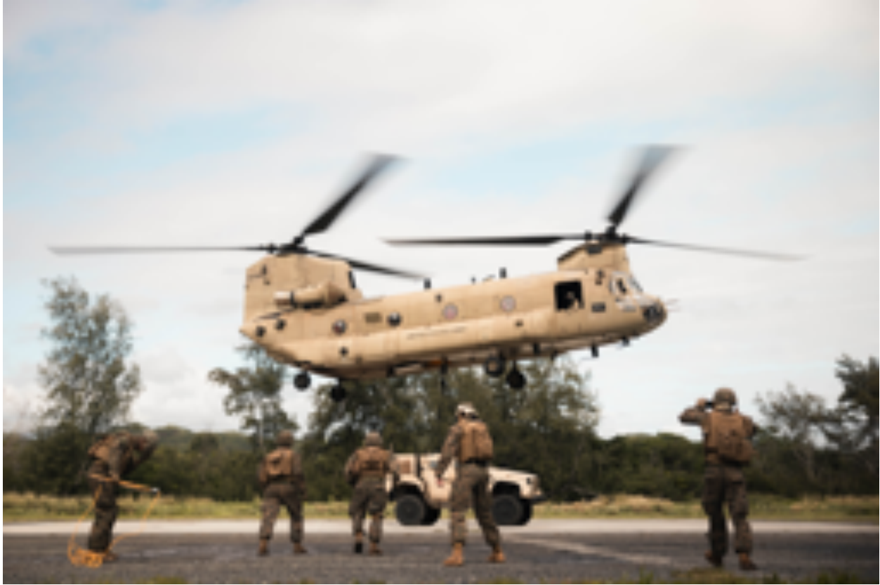
3rd Marine Division 02.02.2024

U.S. Marines with 3d Littoral Logistics Battalion, 3d Marine Littoral Regiment, 3d Marine Division, step away after hooking a Joint Light Tactical Vehicle onto a Army CH-47 Chinook during the 3d Littoral Logistics Battalion's Helicopter Support Team training at Marine Corps Training Area Bellows, Hawaii, Feb. 2, 2024. The 3d LLB undergoes transportation training under the pressure of a tactical scenario in order to prepare realistically for future operations.