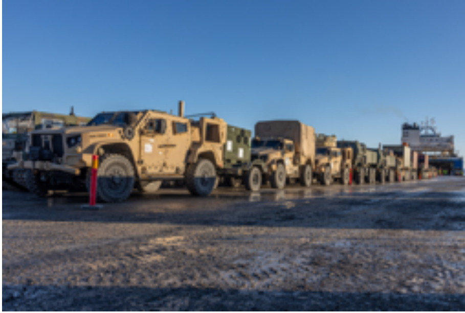
TALVIK, NORWAY II Marine Expeditionary Force 03.02.2024

U.S. Marine Corps Joint Light Tactical Vehicles with Combat Logistics Battalion 6, Combat Logistics Regiment 2, 2nd Marine Logistics Group, staged at a pier offload in preparation for Exercise Nordic Response 24, Talvik, Norway, March 2, 2024. Exercise Nordic Response 24 is a biennial NATO exercise designed to enhance military capabilities and allied cooperation. This exercise will test military activities ranging from the reception of allied and partner reinforcements and command and control interoperability to combined joint operations, maritime prepositioning force logistics, integration under challenging Arctic conditions, in high-intensity warfighting including rugged terrain and extreme cold weather with NATO militaries, and reacting against an adversary force during a dynamic training environment.