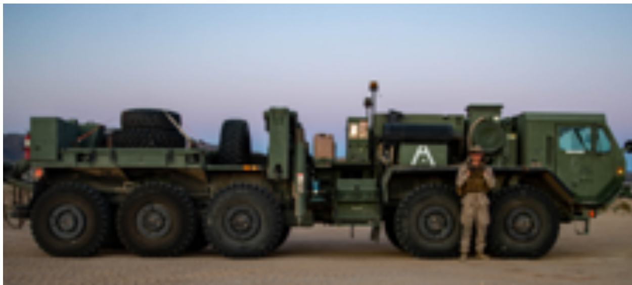
MARINE CORPS AIR GROUND COMBAT CENTER TWENTYNINE PALMS, CA. 2nd Marine Logistics Group 02.28.2024