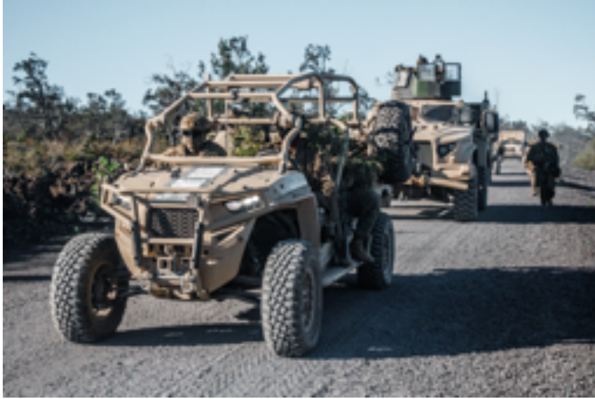
3rd Marine Division 02.10.2024

U.S. Marines with 3d Littoral Combat Team, 3d Marine Littoral Regiment, 3d Marine Division, ride in Utility Task Vehicles for company attacks during exercise Bougainville III at Pohakuloa Training Area, Feb. 10, 2024. Bougainville III is a 3d LCT live-fire exercise focused on decentralized operations to prepare the battalion to command and control forces from dispersed locations. (U.S. Marine Corps photo by Sgt. Grace Gerlach)